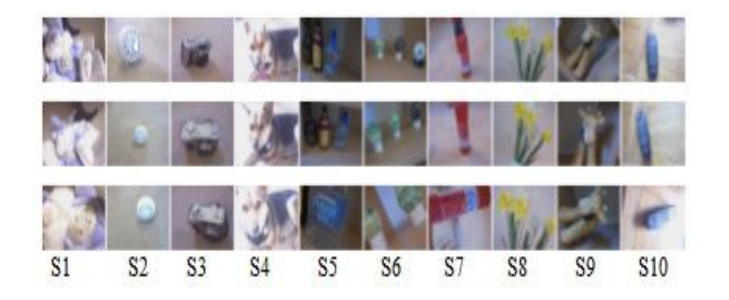
Fig. 2. PCA-SIFT dataset used for image retrieval