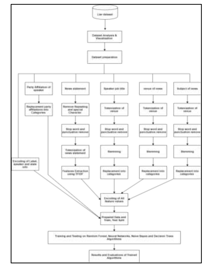
Fig. 1. The High-Level Architecture of the Entire Process.

We conduct an investigation to check the missing value because it can affect the overall performance of algorithms. Thus, we found that 3565 speaker job-titles were missing, 2747 state information missing, and 129 venues. Initially, we replaced the missing values with NaN, and after that, we replaced these with unknown words. It is worth mentioning that, based on our observation, using our method to handle the missing value does not make a significant difference or even any difference.