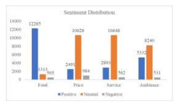
Fig. 2. Distribution of Sentiment Labels.

3) Evaluation: Evaluation for both machine learning and deep learning is using kfold cross validation technique, with the number of k = 10. The scores that evaluated is f1-scores.