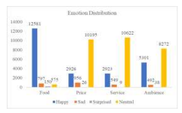
Fig. 3. Distribution of Emotion Labels.