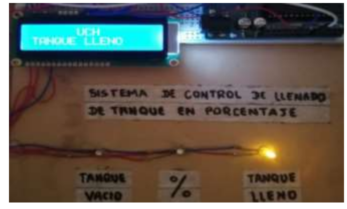
Fig. 10. Tank Full.