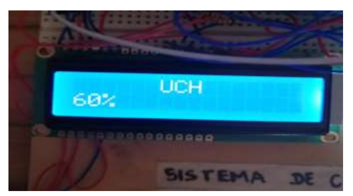
Fig. 9. Tank Fill to 60%.