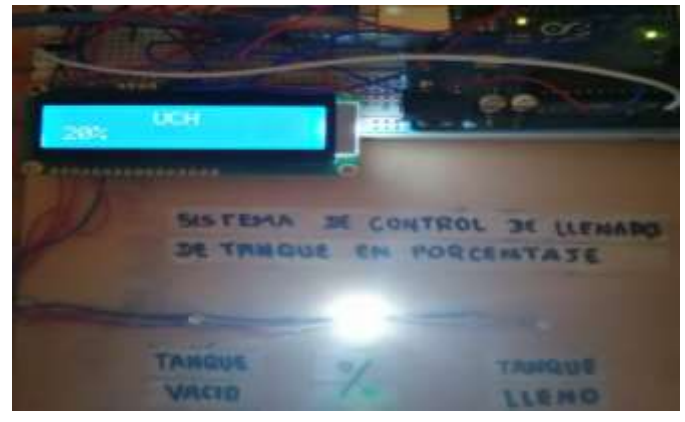
Fig. 8. Tank Fill to 20%.