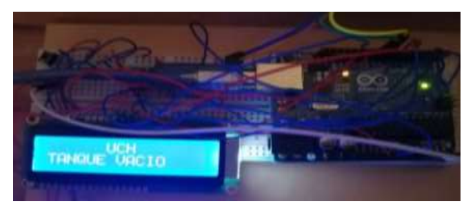
Fig. 6. Starting the Process