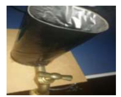
Fig. 4. Water Container.

As shown in Fig. 4, the manufactured container will act as a water tank in which the liquid will be stored and then discharged through the discharge valve.