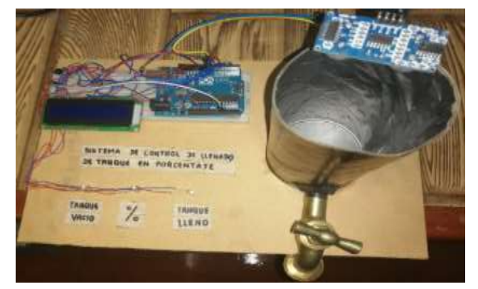
Fig. 5. Water Monitoring System

As we can see in the previous figures, the work of the water percentage sensor is what is expected, finally when it passes 90% on the LCD screen the message "TANK FULL" will be displayed as the reader can see in Fig. 10, at the same time it will turn on an amber led, time in which the filling process will be concluded, at this moment the water pump will stop working until the water level drops to 20%, with which the process will start again.