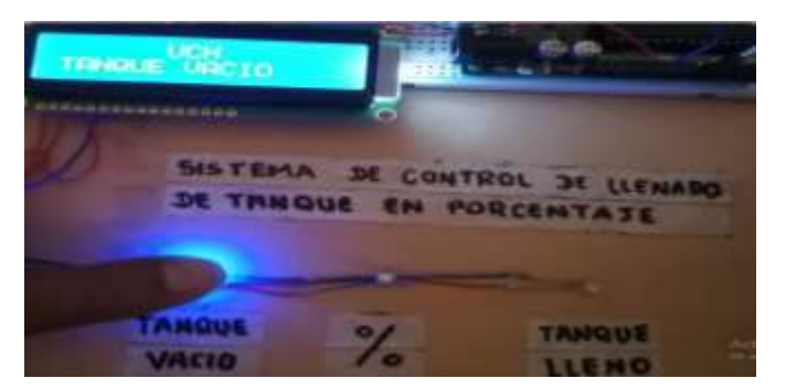
Fig. 7. Process Start Indicator Led.