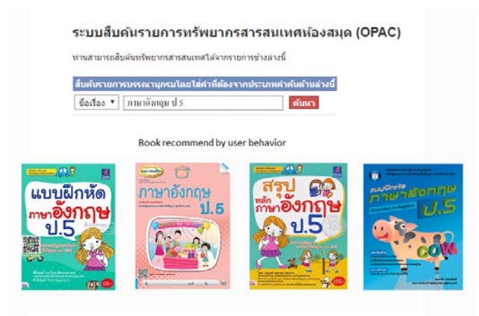
Fig. 4. Example of OPAC Implement with Book Recommendation.

in grade 5", the algorithms arrange the top four highest scores to show from highest to lower respectively the program shown in Fig. 4.