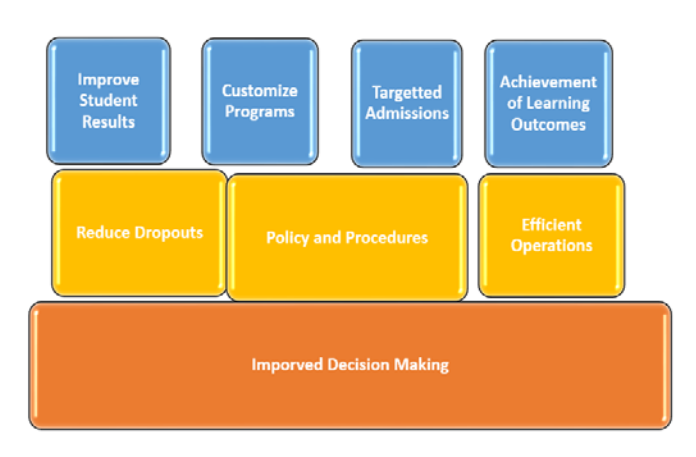
Fig. 3. Benefits of Analysis of BD in HEd.

Based on the above framework, the BD which can be collected from various heterogeneous sources and can provide benefits which can be summarized as shown in Fig. 3.