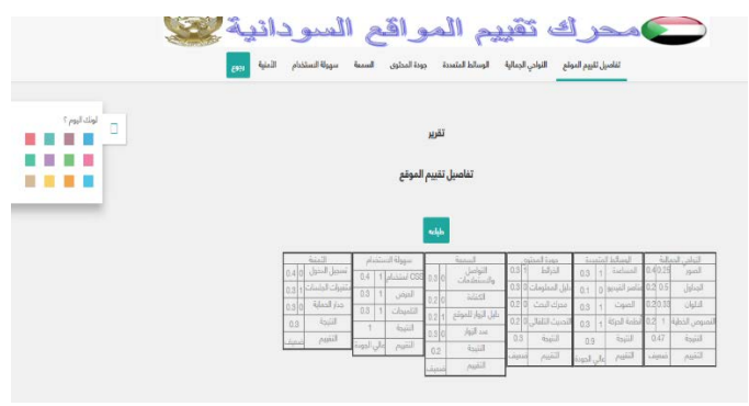
Fig. 2. Implementation of the Evaluation Details Screen.

Following are the various outputs of evaluation reports done in different types of Sudanese educational websites. Implementation of the evaluation details screen is shown in Fig. 2 which is one of the implementation result of the proposed system.