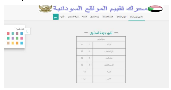
Fig. 3. Implementation Screen of the Content Quality Details.

The above figure depicts the implemented image of the evaluation details screen with all the details of the evaluation of the website, details of all standards such as aesthetics and multimedia, quality of content, reputation, ease of use and security etc.