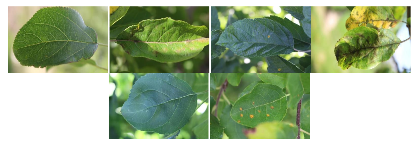
Fig. 2. Sample images in the dataset.

4) Images segmentation: Segmentation was done based on the area by extracting the contaminated area using the kmeans technique. Image clustering commands were applied to only *a and *b components using the k-means method, and the images were divided into healthy and infected leaf areas. After this stage, because the disease spot had a smaller surface than the leaf surface, this area was selected. The remaining image processing and feature extraction operations were used on the picture of the diseased spot.