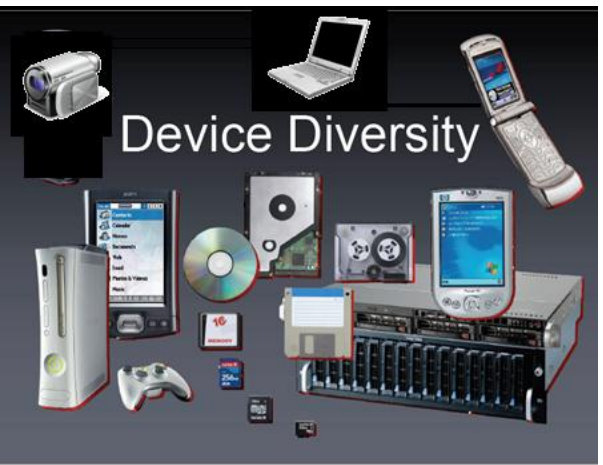
Figure 1: Difference examples of Digital Devices