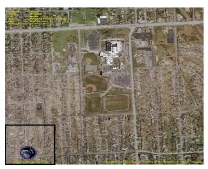
Figure 11. Registered image 2 using correlation based and transfrom based methods