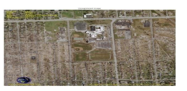
Figure 8. Source image 1