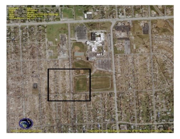
Figure 10. Registered image 1 using correlation based and transfrom based methods