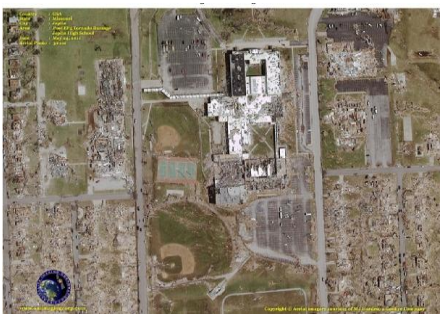
Figure 7. Source image taken from different angle