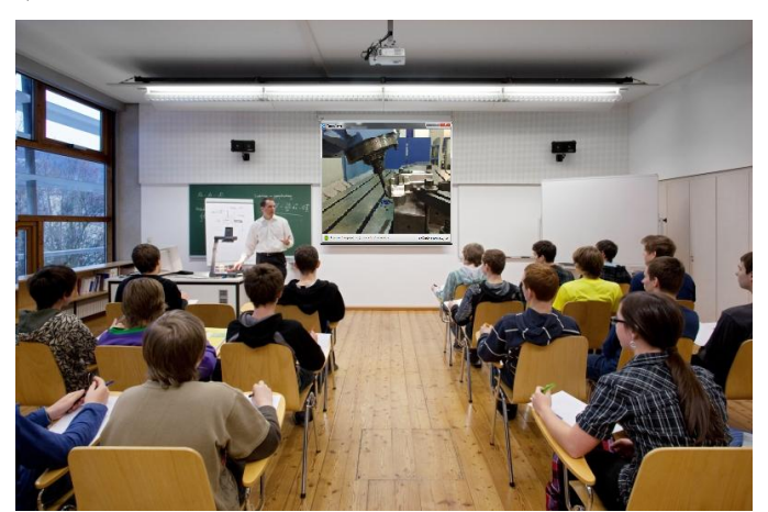
Fig.1. Illustration of Videoconferencing [4]

3) "On the job training" – OJT: Currently educationally promising developing area of teaching, is the use of on-line camera with high picture quality in solving of specific given tasks (projects), and troubleshooting. This is the solution of practical examples of manufacturing components in the presence of the teacher, providing advices to solve of given project, practical skills training, using the same techniques as in engineering practice, analysis of failure technique and the like. An on-line conference led by a teacher, team members communicate each other and suggest possible solutions to production of parts. These were used in our dynamic education for students of PPT proposition, and within were proposed and presented effective ways of education for reaching desired target – effective dynamic education for students of PPT (Fig. 1).