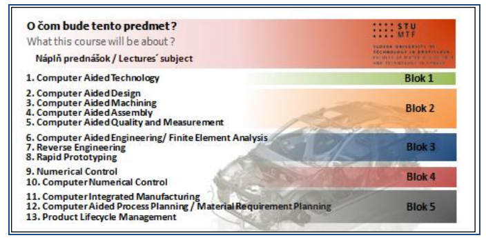
Fig.2. The slide created in MS PowerPoint

2) In the PowerPoint program: in the form of slides which included basic information from the sphere production components, design and manufacture of forming tools, modelling and by means of CA system programming whereby the most important information was highlighted with bold letters (Fig. 2). The information was contentually balanced for the needs of soluting the given task. Materials are available to students on-line at a distance without physical contact and attendance at local schools, too.