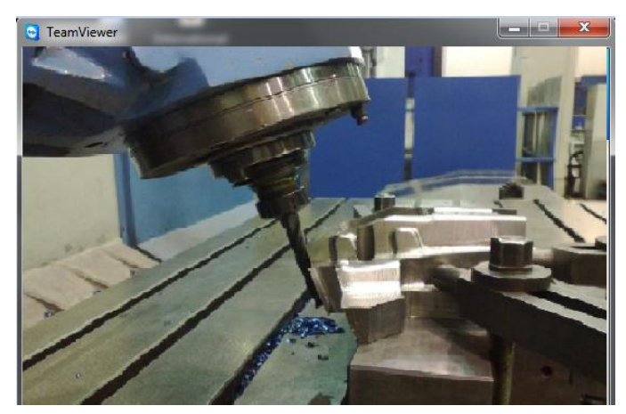
Fig.7. On-line monitoring of production of knife on the computer

Production of knife had to be carried out either directly on the machine tool. Since students have the opportunity to be directly in contact with the machine tools and directly see its production, this possibility was provided by them so. on-line learning in real time. On-line teaching students with software and hardware support to allow students to acquire required knowledge and skills at a distance without physical contact and attendance at local schools MTF in Trnava. Therefore, it can be seen in our case, a very effective and alternative way of teaching. Within this dynamic learning, students were provided a computer program Team Viewer (Fig.7).