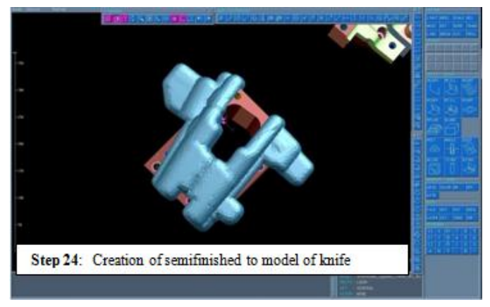
Fig.5. . Video-manual for programming

5) The video instructions: to create a text-pictorial procedures were created the video instructions (Fig. 5). As the component can be modeled several techniques - methods of modeling and programminng, were presented in video-all manual modeling techniques that offer a specific program design, in which the students drew. To enable students to understand the various techniques of painting. User-created video is also available to students on-line at a distance without physical contact and attendance at local schools.