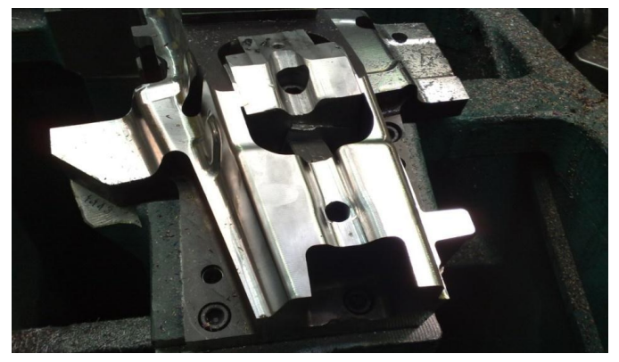
Fig.9. The final shape of manufactured knife

work to eliminate the remaining allowance 0.05 mm on both parts by qualified professionals, which it used in abrasive bodies clamped straight grinder. This operation was the most important to get right and precision moldings produced by crimping tool. The result was a production made knife that meets all the required parameters (Fig. 9). We can state that the selected way of machining the component has met the required aims. Based on the performed strategy of the production and character of the selected component, the students could understand the strategies of the programming procedure 3-axis and 5-axis machining. They could think forwards with reference to minimization of the production costs and working time.