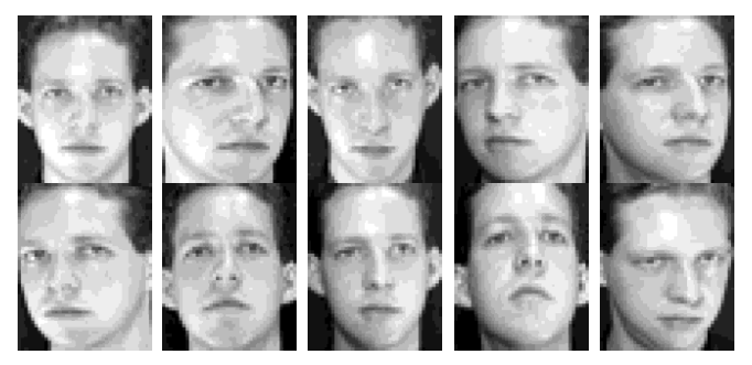
Fig. 4. Ten images of a specific class from the ORL database. The top row represents the training samples and the images in the bottom row are testing samples

each subject, we choose the first five images as the training images and the rest images are used for testing. From the Tab. 3, the recognition results of these four methods are close. Since the deletion operation in CSRC, the sparse coding vector has more discrimination than CRC, so CSRC has 1.5% higher recognition rate than CRC.