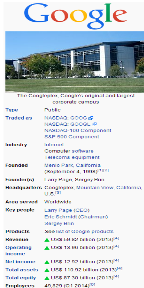
Fig. 1. Google Wikipedia article infobox 3

structured table, called infobox, summarizing essential attributes for that entity lives in the top right hand of each article [23]. It is the core attributes of the article infobox that this study stands on for the classification of named entities without any other prior knowledge. The snapshot in Figure 1 illustrates the Wikipedia article infobox related to "Google", which corresponds to a named entity of type Organization ( http://en.wikipedia.org/wiki/ ). The table summarizes very important unique properties of the entity in the form of attribute-value pairs. Consequently such tables are extracted, stored and analysed for the purpose of NE classification.