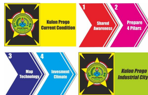
Fig. 3. Smart City Priority Steps for Kulonprogo District.