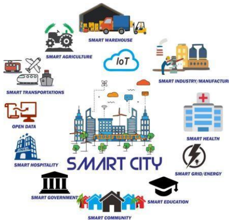
Fig. 2. Smart City Composition Architecture.

As shown in Fig. 2, smart city has supporting architectural components that can make a city become a smart city. The supporting component for the realization of smart city in a city that is prepared to become an industrial city are: smart warehouse, smart industry, smart healthcare, smart grid / energy, smart education, smart community, smart government, smart hospitality, open data, smart transportation, and smart agriculture.