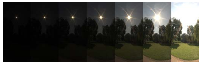
Fig. 2. An HDR Sunny Scene Captured with different Exposure Settings of a Standard Camera.