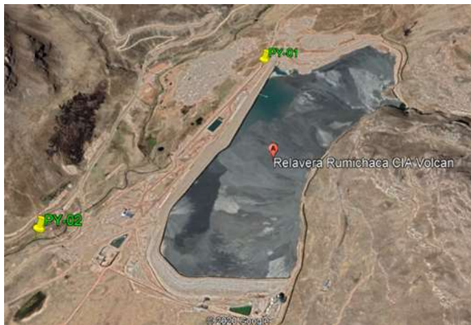
Fig. 2. Monitoring Points in the Upstream and Downstream Yauli River.

Points PY-01 and PA-01 belong to the upstream stations of each river in the project and points PY-02 and PA-02 downstream, in addition to each monitoring point was evaluated for wet and dry season. As shown in Table I.