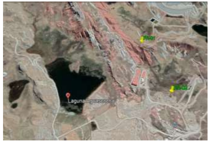
Fig. 3. Monitoring Points in the Andaychagua River, Upstream and Downstream.