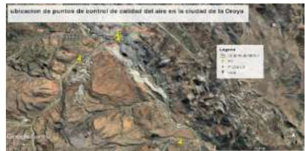
Fig. 2. Location of Monitoring Points.

This study is based on the evaluation of air quality, which includes the La Oroya district as a scope, where three fixed stations were established in the following areas: Oroya Antigua, minor town of Huari and Santa Rosa de Sacco, installing equipment sampling for particle evaluation [19] as illustrated in Fig. 2.