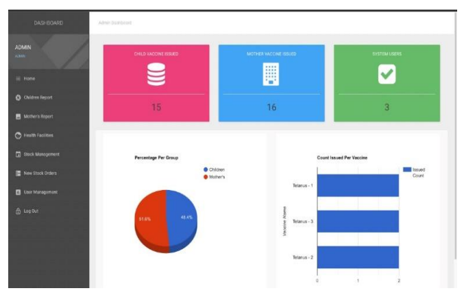
Fig. 5. System Dashboard.