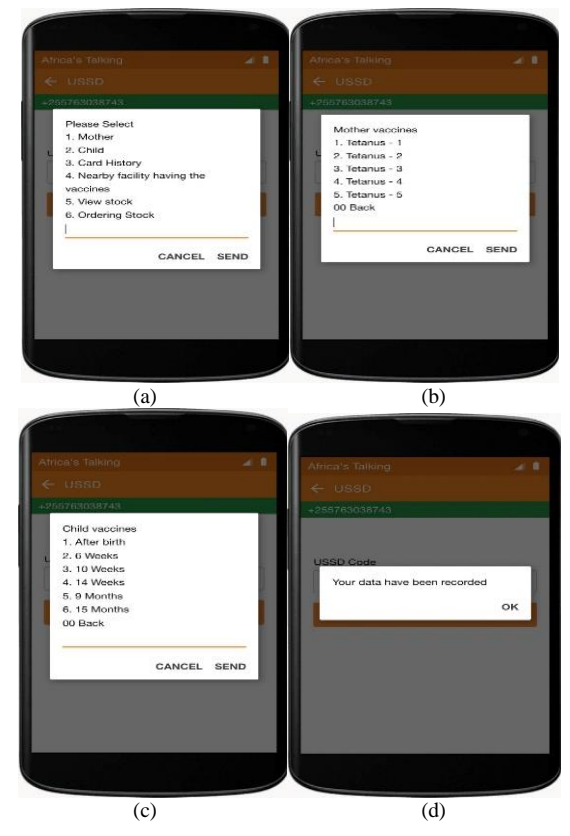
Fig. 4. A Representation of the user Interface that will be used to Submit Immunization Data. (a): List of Services Available in the Registry, (b): List of Vaccines Issued to Mothers, (c): Periods of Vaccines to Children, (d): Data Submission.

2) Backend interface: The system dashboard will be used by the regional immunization officers to view real-time immunization data submitted by various health facilities. The data will be used to measure performance as well as vaccines utilization as shown in Fig. 5 to generate reports.