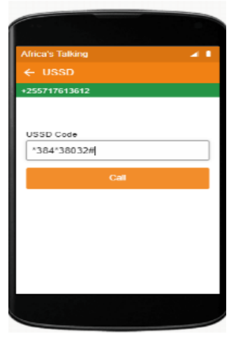
Fig. 3. Dialing USSD Code to Receive the Vaccine Registry.

The health worker has to select the kind of service to be offered to a patient (Fig. 4A), for example, if the health worker is to issue a vaccine to a mother, she/he will select option 1 so the vaccines menu to be displayed (Fig. 4B). Similarly, if option 2 is selected, the period of children's vaccines will be displayed as shown in Fig. 4C. After those services, the data has to be submitted to the regional immunization office as shown in Fig. 4D.