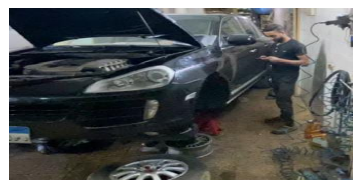
Fig. 1. A Negative Wasting Time Activity (using Mobile while being in Work).

phone at work. Moreover, there are a lot of negative activities such as (eating, drinking, talking to others, standing without work...). Besides, it is difficult to have an employee responsible for monitoring the worker for no less than 12 hours.