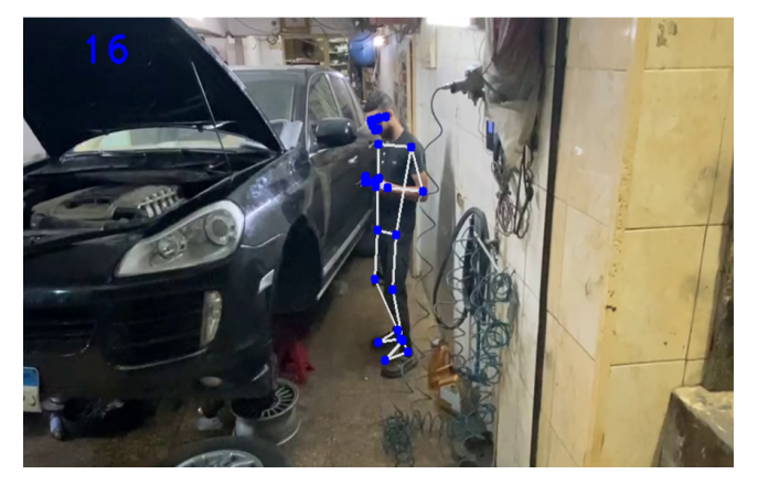
Fig. 4. Worker use Mobile.

The main contribution of this paper is to create a human activity recognition system that extract worker poses from the videos by using pose classification. The system used a dollar recognizer (1$) to detect worker positive and negative activities in maintenance workshop. As a result of the presence of many maintenance workshops, a problem occurred which is many workers neglect their work resulting in the occurrence of negative activities. Therefore, this paper is needed to detect the positive and negative activities and differentiate between them without the need for a person to monitor these activities and depend on the computer as an alternative. The purpose of this paper as well as to facilitate the reduction of the waste time done by each worker so they can be more productive. Moreover, positive activity is detected to reward the committed workers and to evaluate the performance of the workers in general.