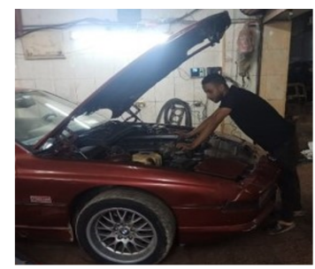
(a) Changing oil