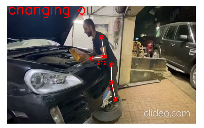
Fig. 3. Worker Changing Oil.

as shown in Fig.3, Fig. 4 and comparing them with the points that were taken from the collector of the data set. The system can determine the type of activities that the worker performed in the video.