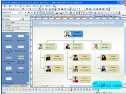
Fig 3.2 Edraw Flowchart saves to an XML-based file format.

[5] Tools by which such diagrams can be drawn are any, for example Visio, Edraw, SmartDraw etc. A sample tool can be seen in Fig 3.1. Most of these tools are object oriented and are therefore easy to implement. Fig 3.2 shows a tool that saves data to an XML based file format. Accordingly a parser / translator that converts the data flow diagrams in XML format or reads an XML file for converting it into a diagram by identifying the diagramming notation that the user is acquainted with, can be provided additionally so as to take care of the problem of differences in diagramming notations.