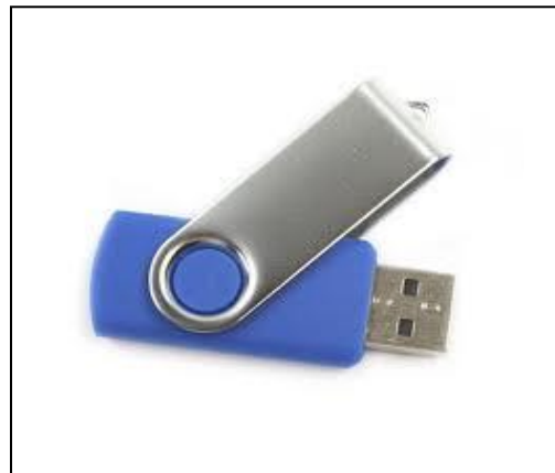
Figure 1. Look of a Normal Pen Drive.

The look of the normal pen drives which are being present now has no special features are as shown as follows in the figure 1. There is no display unit or in-built USB port for data transmission. It cannot operate without a computer system; completely depend on the computers for working with it.