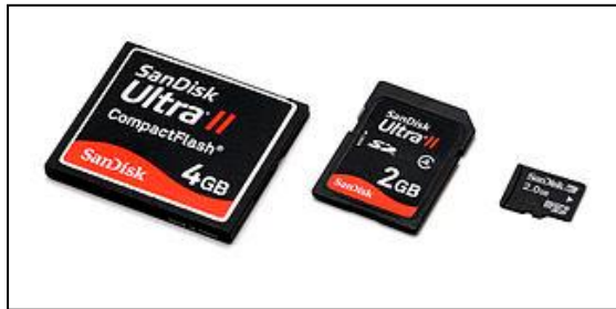
Figure 5.Types of memory cards

A memory card can also be called as a flash card and it is basically a type of electronic storage device based on flash memory concept for storing digital information like films, song and photos. The Memory can be used in many electronic devices like mobile phones, digital cameras and in MP3 players. It can also be used in laptop and desktop computers. The memory cards are basically small in size and rewritable storage device. The data which are stored in it will be retained even without power.