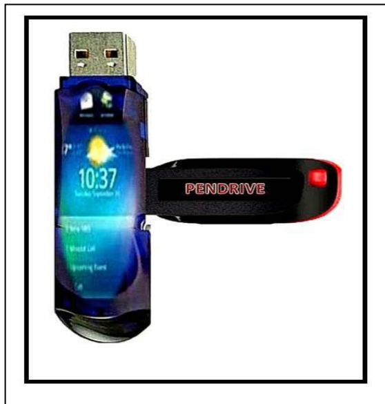
Figure 3. Data Transmission

The Data transmission is also the advanced feature in the computerized pen drive. Using this feature we can transmit the data to any other USB devices and the transmission from any other USB devices can be made very easy and simple using this computerized pen drive. The working of the computerized pen drive is similar to the computer system. The data transmission through this computerized pen drive will reduce the consumption of power. The need to connect portable electronic devices to each other has accelerated the adoption of USB on-the-go as an industry standard wired interface [4] for interfacing the two devices concepts. The data transmission in the Computerized Pen Drive can also be done without the use of the system.