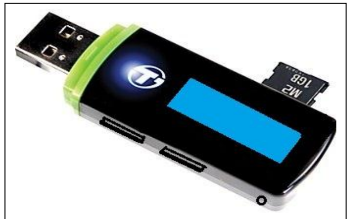
FIGURE 6. MODERN AND DIGITALIZED USB DEVICE WITH EXTENDABLE MEMORY CAPACITY

The hardware space required for the implementation of this idea of creating the memory slots in the body of the pen drive does not occupy much space. The size of the memory card is very less. The following figure shows the structure of the memory card slots in the body of the pen drive. The inclusion of this particular feature in the pen drive makes the computerized pen drive a complete advanced model hence giving raise a new gadget for storage and for data transmission purpose. The major factor which has to be kept under consideration is the size of the pen drive device because the main advantage of these USB pen drives is that they are basically very handy and compact by implementing this feature we must not spoil the nature of the pen drives look and smart sizes. The one more important thing is the cost for implementing this features on a pen drive device must be low as possible.