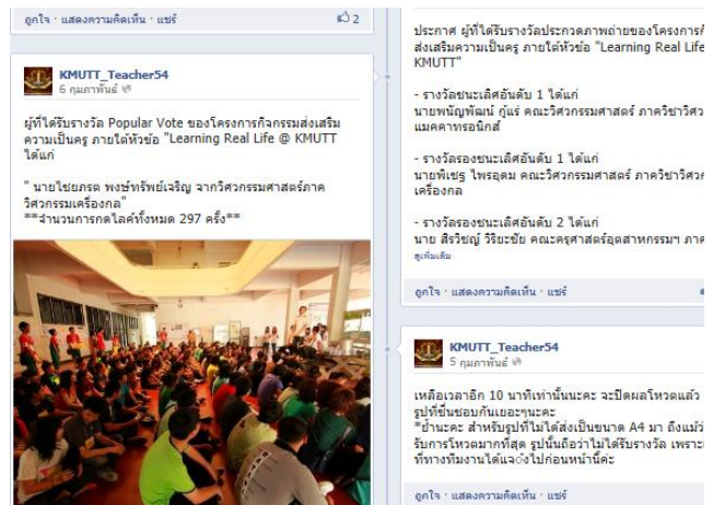
Figure 4. Screenshot of comments between learners and instructors