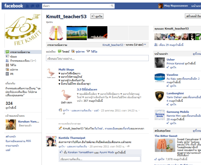
Figure 1. Screenshot of main page for Project-Based Learning (2010)

Screenshots of social network website (facebook) which were used for Project-Based Learning in the academic year 2553 B.E. (2010)