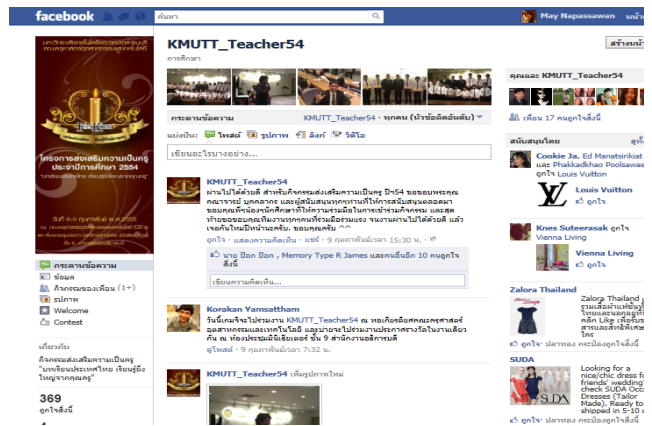
Figure 3. Screenshot of main page for Project-Based Learning (2011)

Screenshots of social network website (facebook) which were used for Project-Based Learning in the academic year 2554 B.E. (2011)