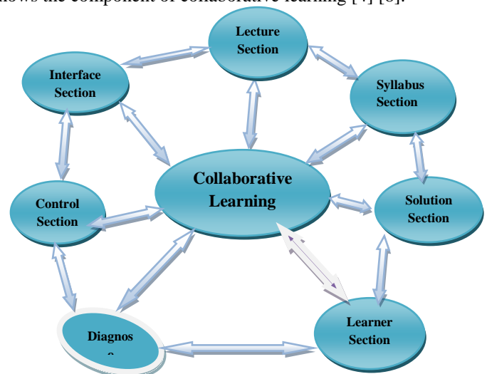
Fig. 3. "Shows the section of collaborative learning"

Syllabus module has course information which stands for the target skill and its component sub-skills, and depicts how they are linked. The teacher's common strategy is to present tutoring, ask questions, and assess answers. It generates and updates a student replica based on knowledge of the learner's ordinary language answers to evaluation questions. Figure 3 shows the component of collaborative learning [4] [8].