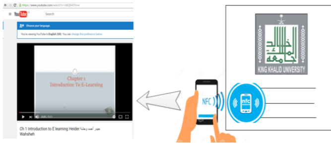
Fig. 2. NFC on student worksheets

To evaluate the proposed method, a questionnaire was designed for 1000 students. The questionnaire asked about the benefits of the proposed method and the authors extracted possible features (variables).