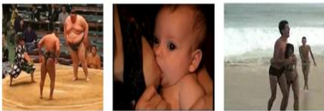
Fig. 2. Sample images from NDPI [26].

For an evaluation of the proposed architecture, we use the key-frames from the NDPI videos. Further details are available in [26]. Fig. 2 shows some samples.