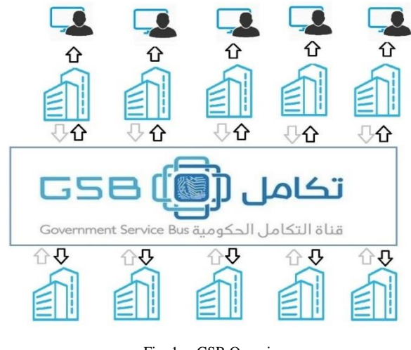
Fig. 1. GSB Overview.

A Web service is standardized method, which allows different systems to communicate over a network. It can be a user requesting a service from a Web server or a Web server requesting a service from another Web server [27]. Web services have many advantages, including multiple heterogeneous platform compatibility [28], language-independency [36], increased information availability and ease of access [29], and maintaining up-to-date data. However, Web services do not have any predefined security model, and therefore require the additional implementation of techniques to protect exchanged information [28], as well as the deployment of a framework that enforces a strong security architecture [30].